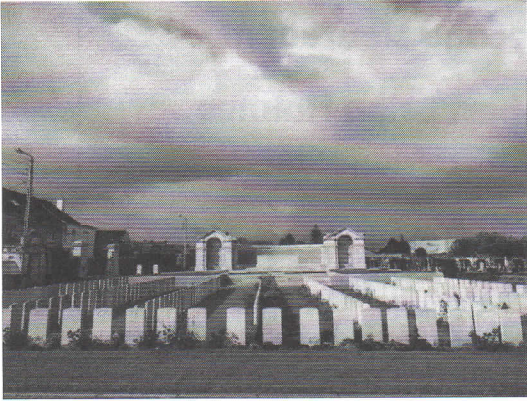
Noeux-Les-Mines Communal Cemetery

His contribution is honoured in the Haileybury College Memorial and Chapel Roll of Honour and on the Bradford Rowing Club Roll of Honour.